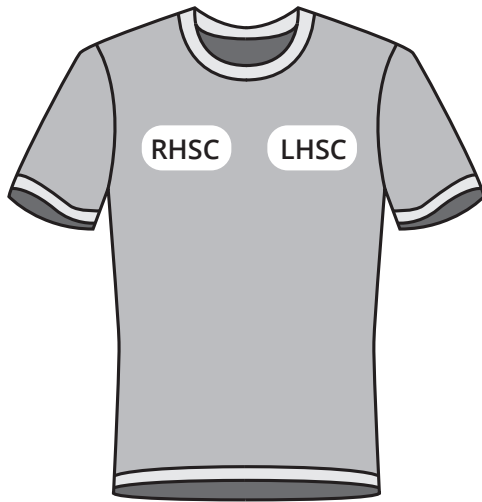
LHSC - Left Hand Side Chest RHSC - Right Hand Side Chest

After something else? Talk to us and we can sort it out.