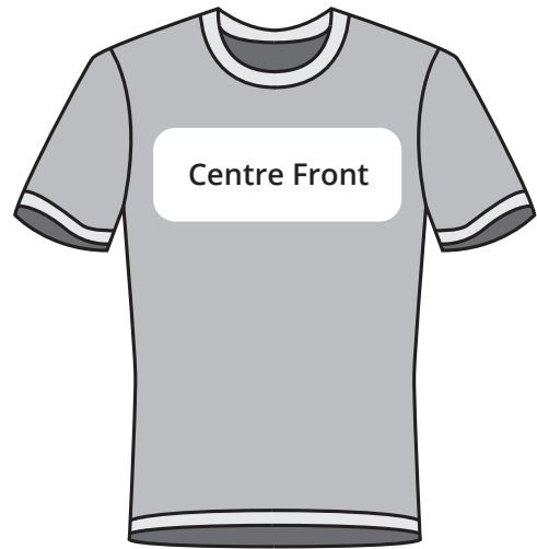
CF - Centre Front